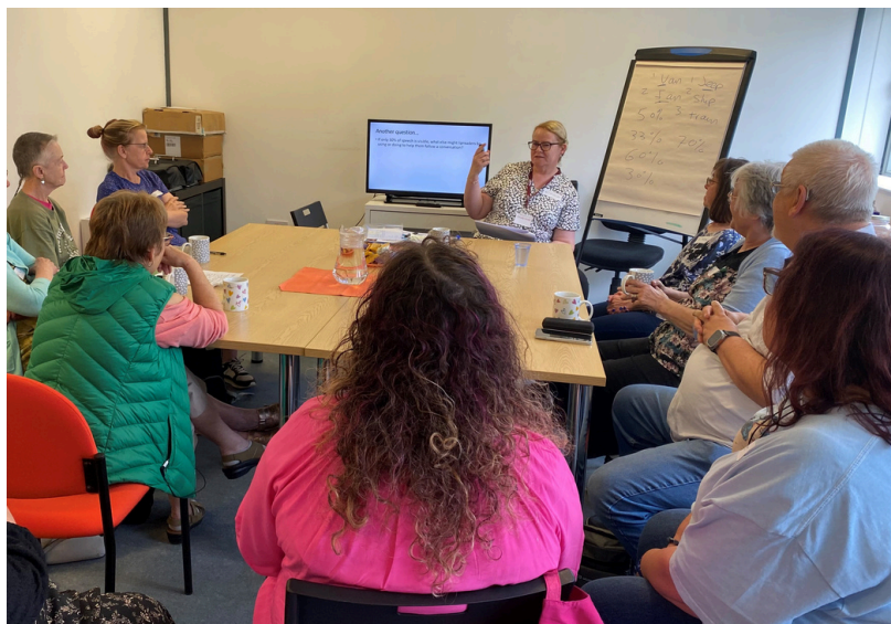
[Image shows a group of people sitting around a table facing the lipreading teacher who is sitting in front of a TV screen and white board.]

We'll share full details soon, but in the meantime would love your ideas for activities, topics, or guest speakers. If you have hearing loss or support someone who does, please let us know what would help. I hope you'll join us!