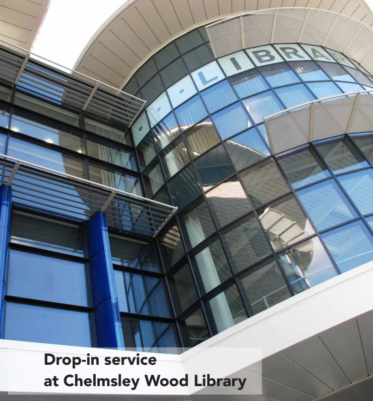
Drop-in service at Chelmsley Wood Library